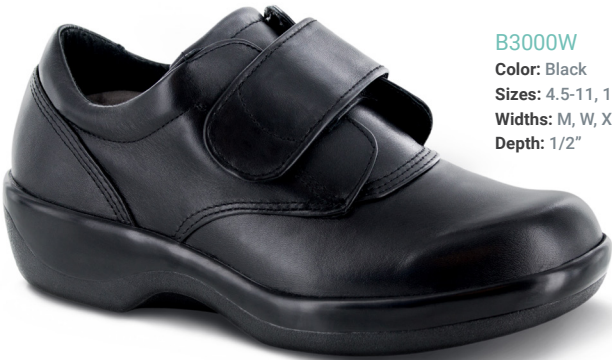
B3000W Color: Black Sizes: 4.5-11, 12, 13 Widths: M, W, XW Depth: 1/2"