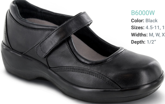
B6000W Color: Black Sizes: 4.5-11, 12, 13 Widths: M, W, XW Depth: 1/2"