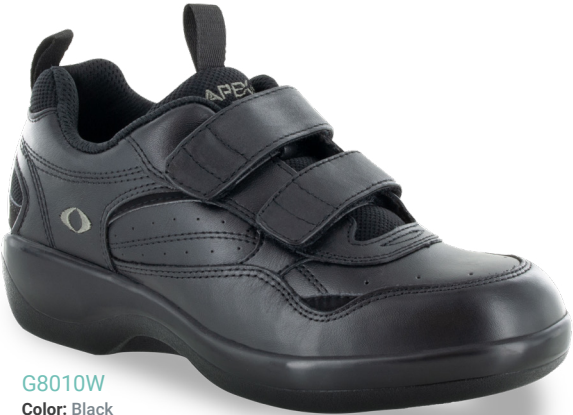
G8010W Color: Black Sizes: 4.5-11, 12, 13 Widths: M, W, XW Depth: 1/2"