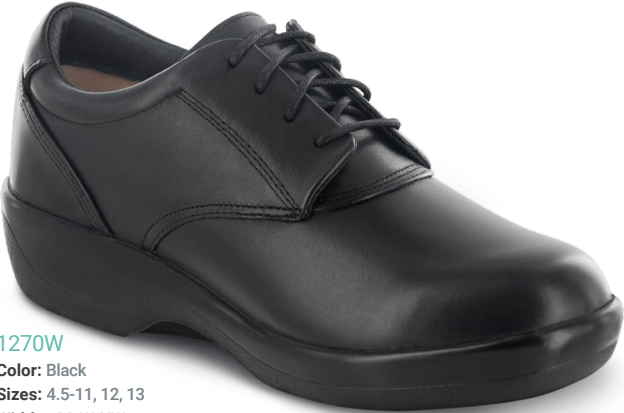
1270W Color: Black Sizes: 4.5-11, 12, 13 Widths: M, W, XW Depth: 1/2"