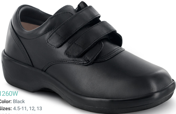
1260W Color: Black Sizes: 4.5-11, 12, 13 Widths: M, W, XW Depth: 1/2"