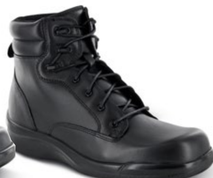
B4500M Color: Black Sizes: 6.5-13, 14, 15, 16 Widths: M, W, XW Depth: 1/2"