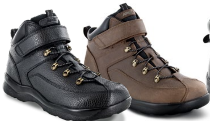
A4000M Color: Black Sizes: 7-13, 14, 15 Widths: M, W, XW Depth: 5/16"