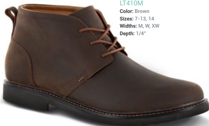
LT410M Color: Brown Sizes: 7-13, 14 Widths: M, W, XW Depth: 1/4"