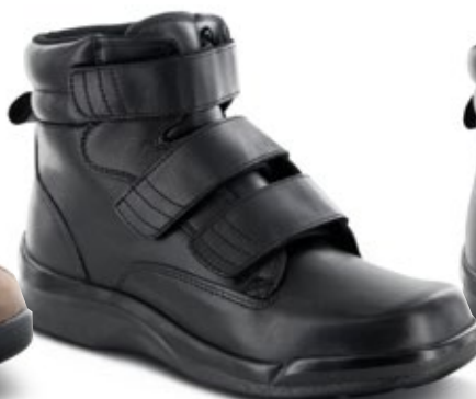
B4200M Color: Black Sizes: 6.5-13, 14, 15, 16 Widths: M, W, XW Depth: 1/2"