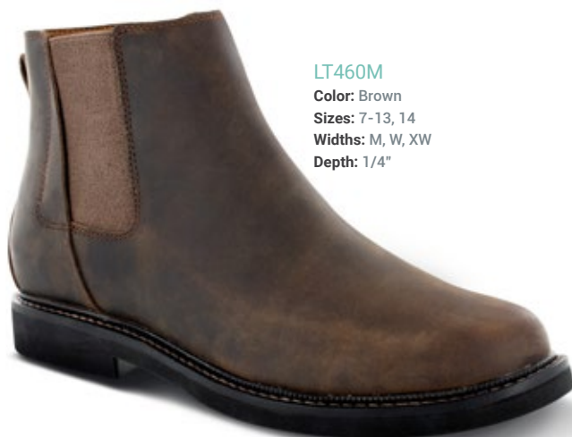
LT460M Color: Brown Sizes: 7-13, 14 Widths: M, W, XW Depth: 1/4"